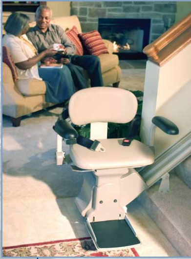
ELECTRA-RIDE™ LT Model SRE-2750