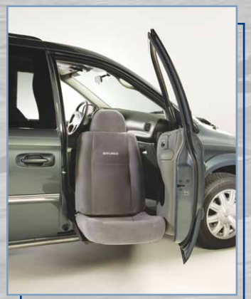
TURNY™ ORBIT® SEAT