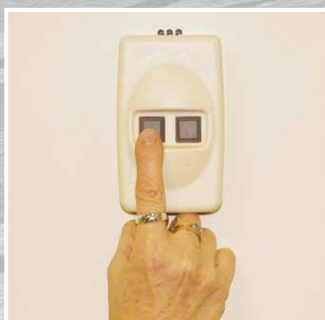
The two wireless call/send controls make the installation simple and clean with no wires running along the wall.

Easy on-and-off thanks to the Electra-Ride II's unique design.