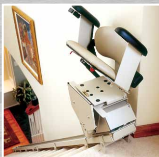
The arms, seat and footrest flip up, creating plenty of space for guests to walk up the stairs.