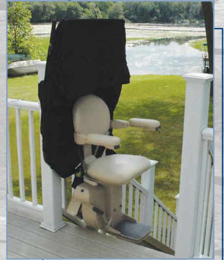
OUTDOOR ELECTRA-RIDE™ Model SRE-2010E The only 400 lb/ 181.8 kg capacity outdoor stairlift... an INDUSTRY EXCLUSIVE!